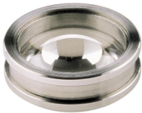
OCULAR 132D INDIRECT VITRECTOMY LENS (Product Code: OIV-132)